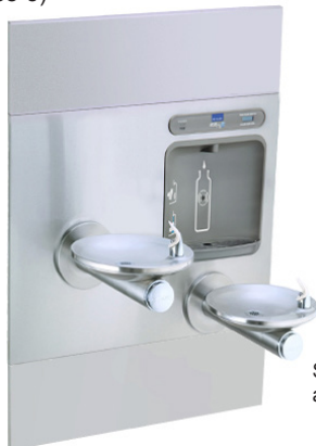
Shown with two optional access panels installed