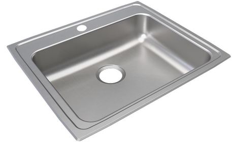
Shown with one-hole configuration. Other configurations available.