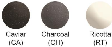
Caviar (CA) Charcoal (CH) Ricotta (RT)

Special Note: Reserve Selection products are sold exclusively, in-store and online, through authorized wholesalers.