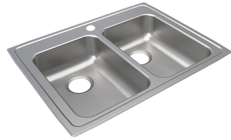
Shown with one-hole configuration. Other configurations available.